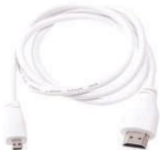
Micro-HDMI to HDMI cable